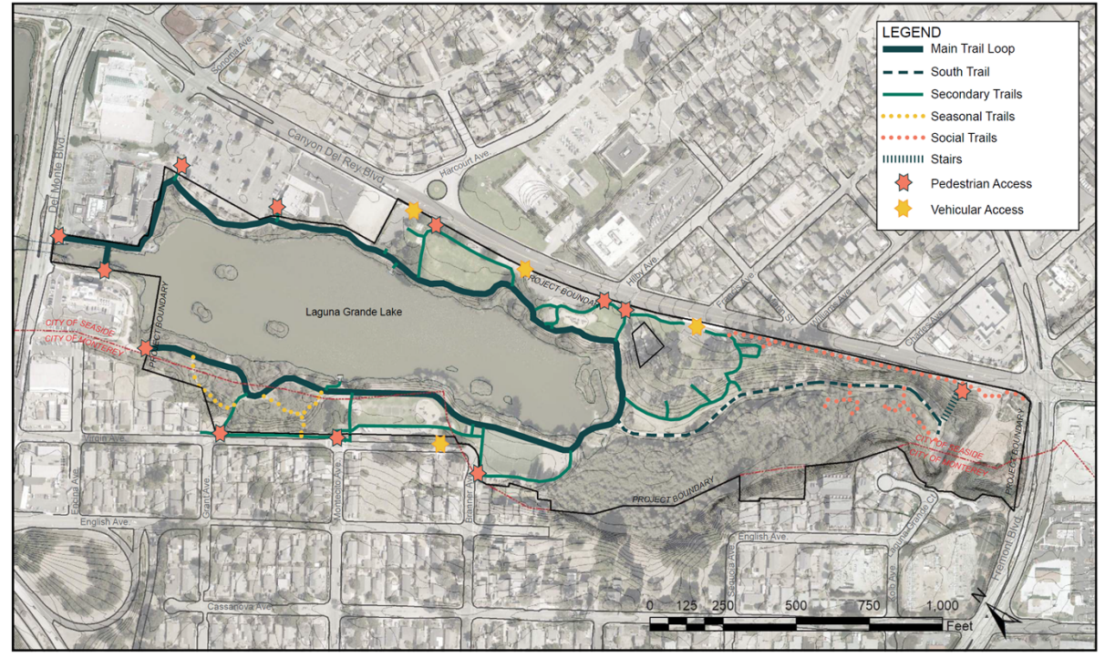
Figure 2. Proposed project (North)